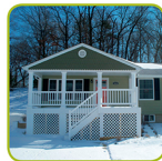
3624 Key Turn St.