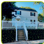
7203 E. Forest Rd.