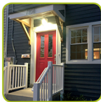
7108 E. Lombard St.